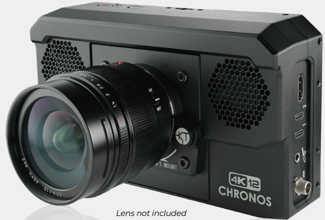
Lens not included